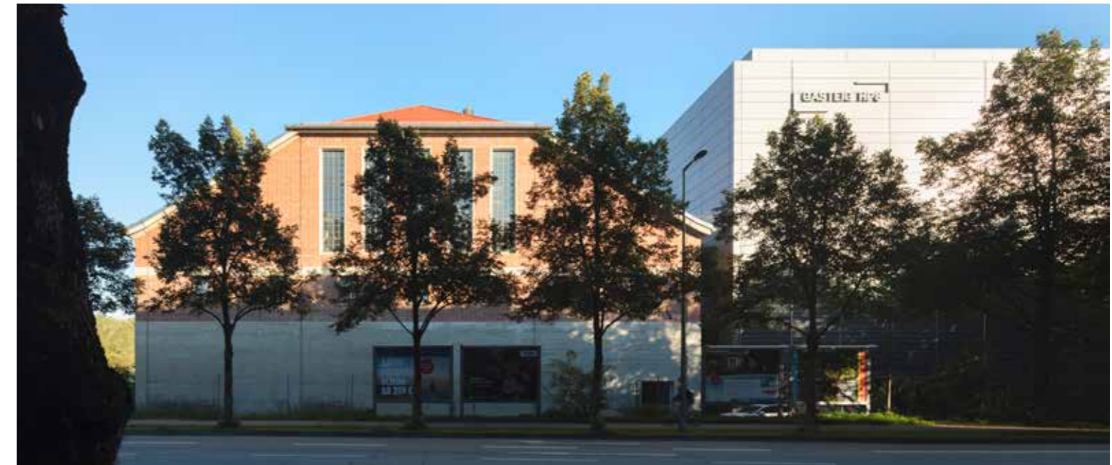
Qbiss by Trimo